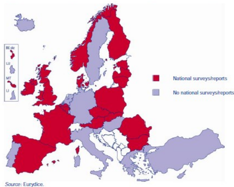
Figure 1. National surveys on teachers' choice of teaching methods and activities, 2010/11

As it is seen in Figure 1, approximately half of all European countries described monitoring the use and success of different teaching methods on an on-going basis.